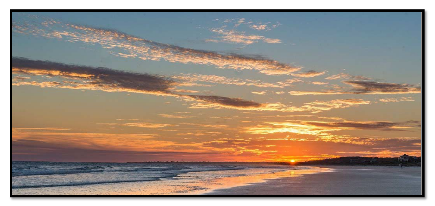
Financial & Compliance Audit – June 30, 2021